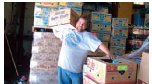
God's Storehouse Employee