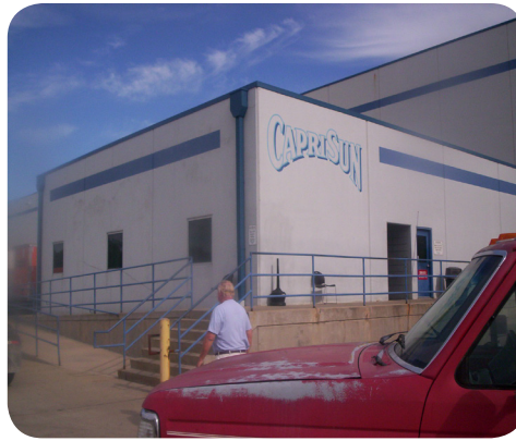
Capri Sun Warehouse in Granite City